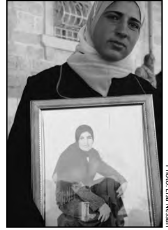
A young woman holds a photo of her sister during a demonstration in Hebron in support of Palestinian prisoners, 2005.