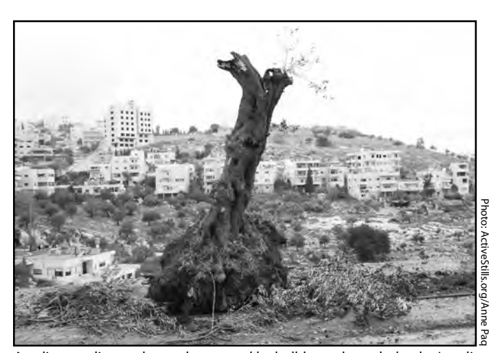
An olive tree lies on the road, uprooted by bulldozers brought by the Israeli army to build the route of the Wall in the West Bank city of Beit Jala, March 2010. Land owned by 35 families are subject to confiscation for the purpose of building the Wall. Beit Jala has already lost three-quarters of its lands because of the building of Road 60 and the Gilo settlement.

The olive tree for Palestinians is a symbol of hope, of peace, of life itself. Since 2000, over 500 000 Palestinian olive trees have been destroyed by the Israeli military and dozens of greenhouses have been destroyed. Israeli settlers in the Occupied Palestinian Territories (OPT) have burned numerous other groves. Destruction of orchards and groves is often part of the confiscation of land to build the separation barrier and Israeli settlements.