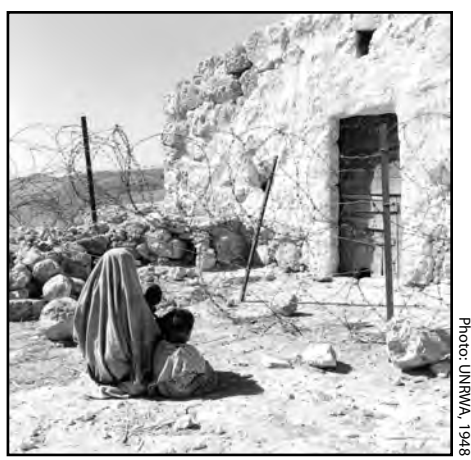
A Palestinian refugee woman cut off from her home by the "Green Line," the armistic line established after the 1948 Arab-Israeli war.

Palestinian refugees are currently denied this fundamental right.