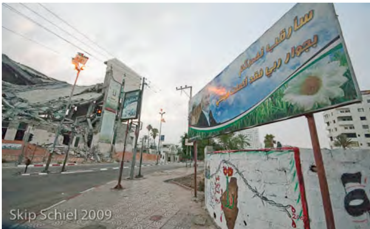
Gaza City, August 2009