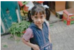
Jerusalem & Ramallah: Old City, Kalandia, road repairs November 3, 2007