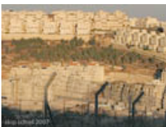
Besieged Bethlehem—the Wall (Cambridge - Bethlehem delegation) December 1, 2007