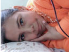
The Slaughter of the Innocents January 12, 2008