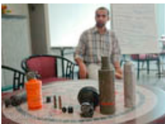
Ramallah: Another Voice concert & the International Solidarity Movement November 1, 2007