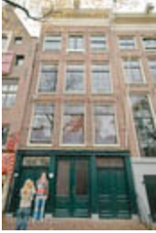
Amsterdam, part 2 October 27, 2007