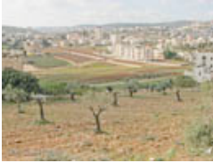
Bethlehem—Anticipating Christmas December 22, 2007