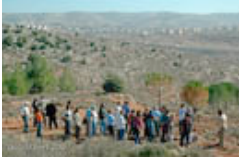
Good Water Neighbors' paths December 3, 2007