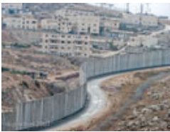
Divided Jerusalem (Cambridge-Bethlehem delegation-2) December 6, 2007