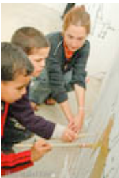
Friends' Play Center, Amari refugee camp, Ramallah November 7, 2007