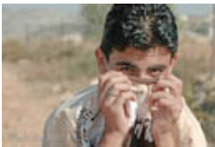
Bil'in: an appointment with tear gas November 17, 2007