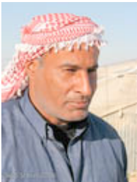
Flood January 20, 2008