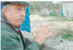
Water in Salfit, sewage from Israeli settlements December 17, 2007