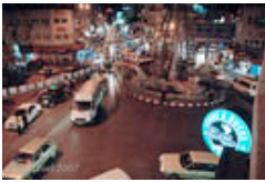
In & around Ramallah