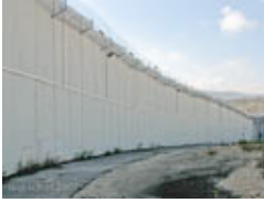
Walk Jerusalem to Bethlehem December 24, 2007