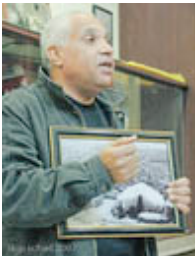
People to People: Cambridge-Bethlehem-3 December 18, 2007