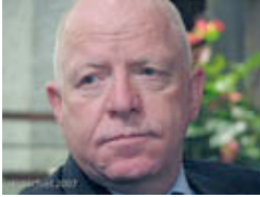
Friends of the Earth Middle East—Mayors' conference December 5, 2007