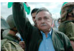
What to Do About an Illegal Highway Cutting Thru Your Land November 9, 2007