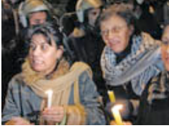
Leaving Gaza—Ramallah demonstration for a Free Gaza