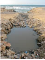
Beach Walk—Gaza January 8, 2008