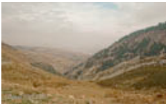
Nablus & Environs, Winter 2007—The City of Fire & Region's Hydropolitics (part 1) December 11, 2007