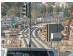
Light rail through East Jerusalem January 1, 2008