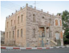
Around my neighborhood in Ramallah