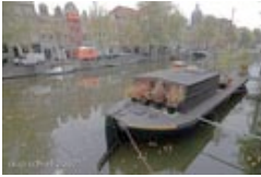
Amsterdam, part 1 October 27, 2007