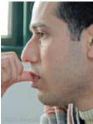
Entering Gaza January 5, 2008