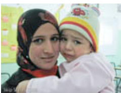
Our Trip to Rafah January 23, 2008