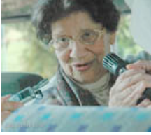
Jerusalem: a Palestinian Perspective November 13, 2007