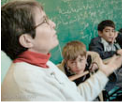
Teaching conflict resolution at the Ramallah Friends School November 14, 2007