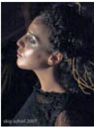
Lorca's Blood Wedding in Ramallah November 17, 2007