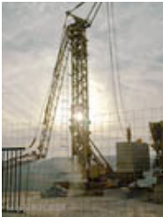
New construction at the Israeli settlement of Ma'ale Adumim January 1, 2008